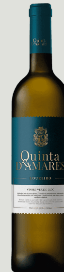
Quinta d'Amare Loureiro